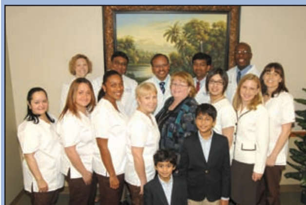
The Digestive and Liver Center of Florida staff is currently celebrating their five year anniversary at their Lake Underhill location.

Interested in finding out how you can prevent colorectal cancer? Contact the bilingual offices of the Digestive and Liver Center of Florida to schedule your appointment today. Most insurances accepted.