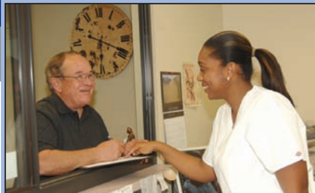
Staff at Digestive and Liver Center of Florida put an emphasis on making a patient smile the moment they walk in the door.