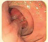
Polyp on Stalk